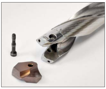
2. Remove the indexable insert from the insert seat.