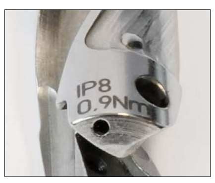
5. Tighten the special clamping screw to the stipulated tightening torque.